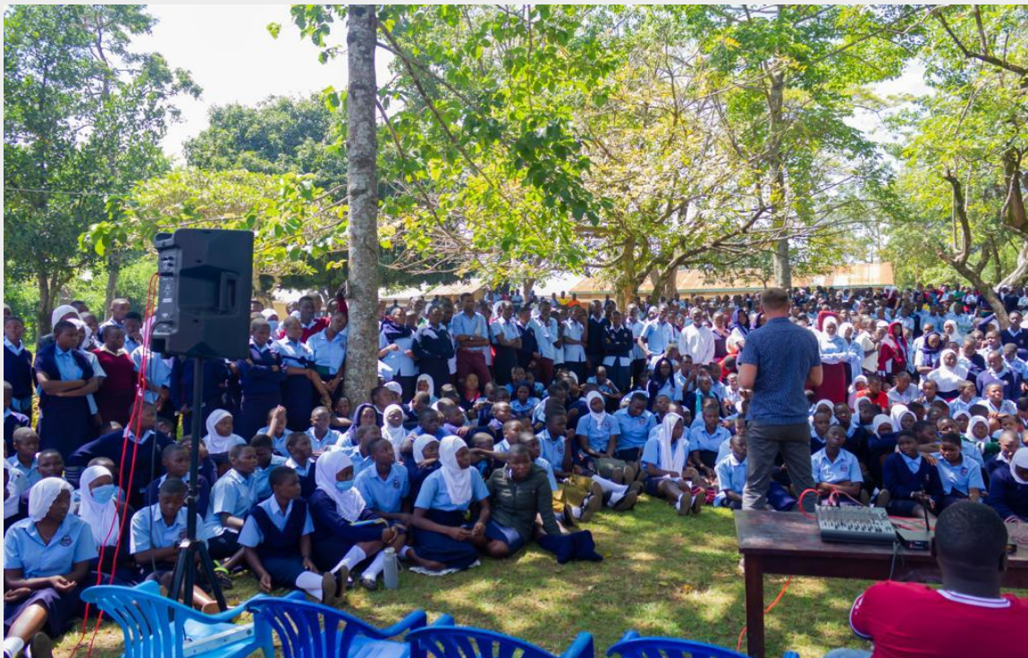
High school ministration with the Canadian team in Busia