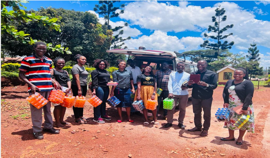
Ministers ready for Good Friday service with inmates in lugazi prison