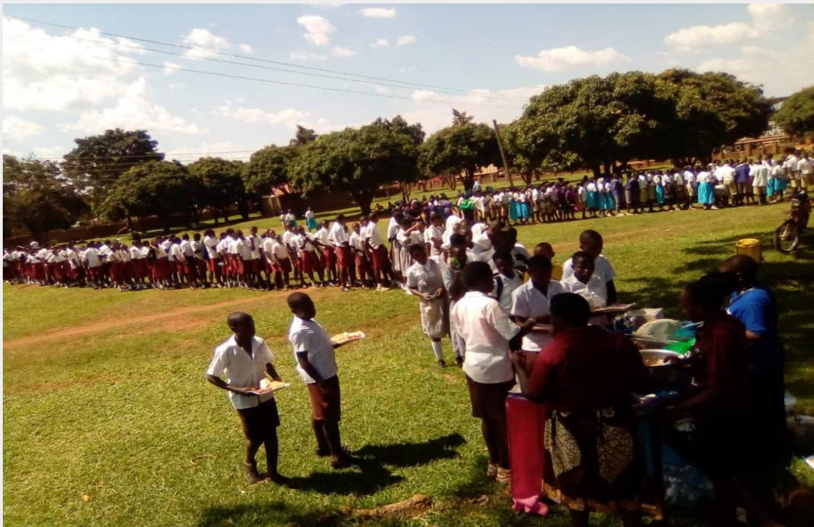
Food time during the P.7 leavers conference in Busia