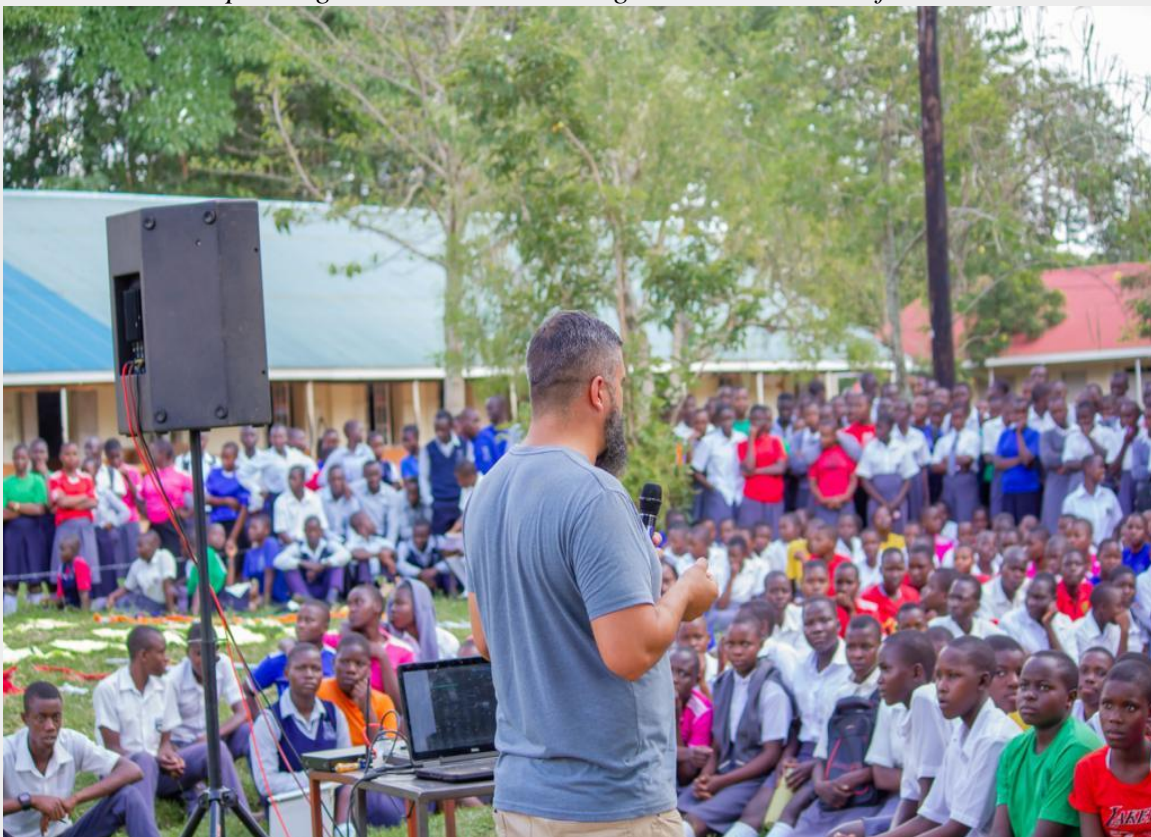
High school ministry