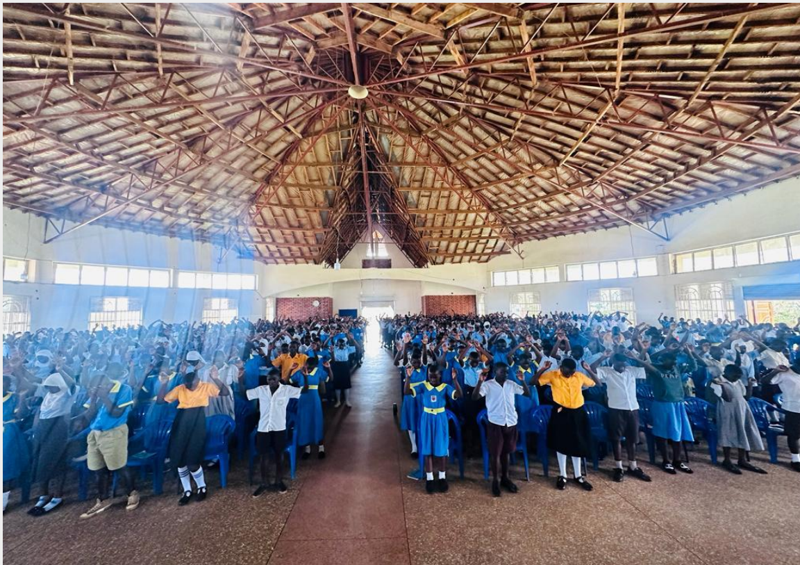
Students responding to the alter call during the P.7 leavers conference in Busia