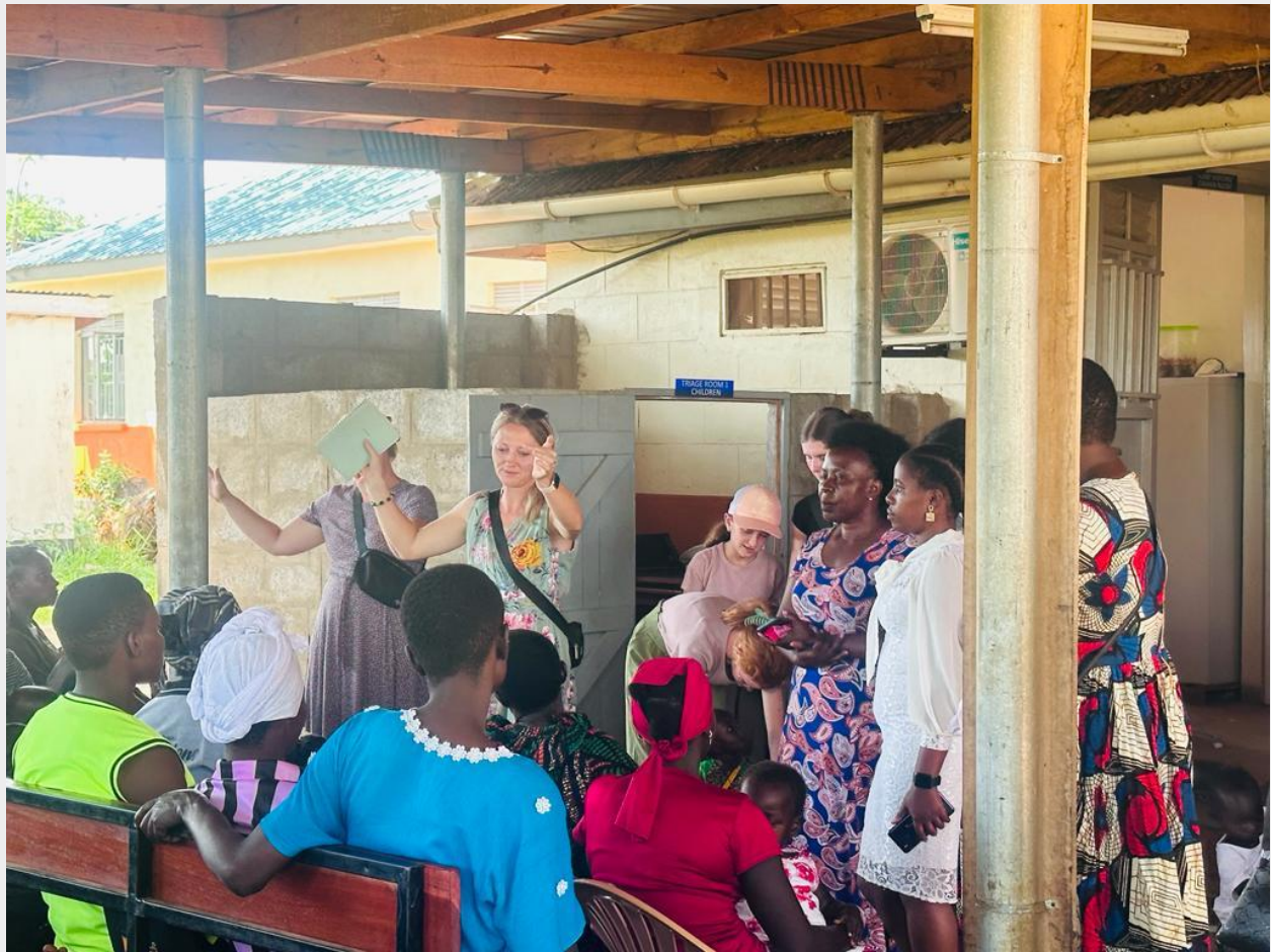
Hospital ministry at Masafu Hospital