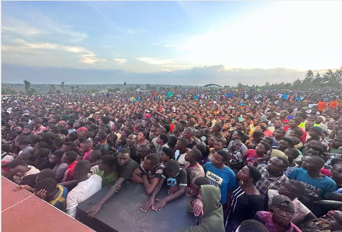
The Rwanda gospel ministration crusade