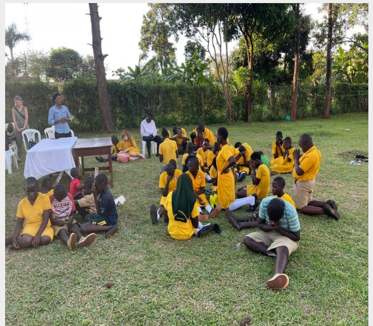
Orphanage homes ministraton